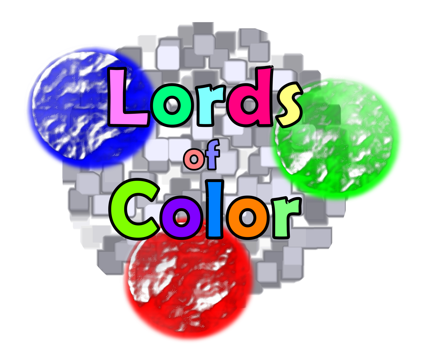
Rulebook - Prototype Edition